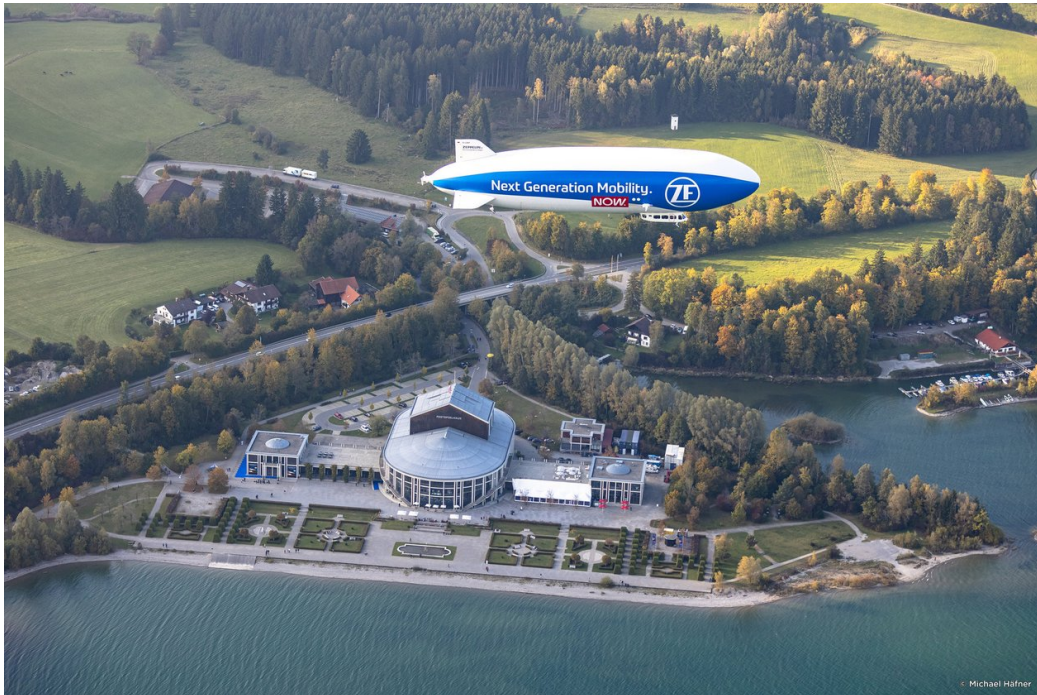
Festspielhaus Neuschwanstein Füssen

At 4.45 p.m. the bus will pick us up for what is actually a short walk to the "Festspielhaus Neuschwanstein" (festival theatre) on the shore of the Forggensee