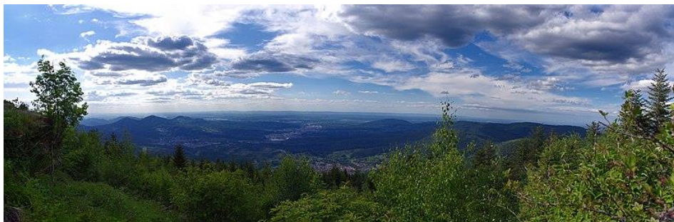
Sven Dittmar Eigenes Werk Blick nach Nordwesten - vor der Teufelsmühle auf einem Stein sitzend - über Löffelau bis zur Rheinebene 30. Mai 2020, Creative Commons-Lizenz