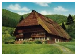
Foto aus Freilichtmuseum Vogtsbauernhofe Gutach