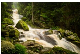
Von Carsten Frenzel from Obernburg, Deutschland - Triberger Wasserfälle, Eigenes Werk, CC BY-SA 3.0, https://commons.wikimedia.org/w/index.php?curid=3277525