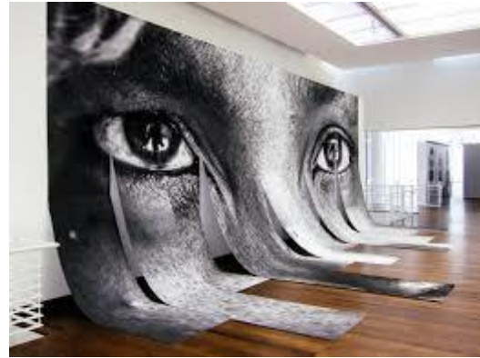
Museum Frieder Burda französischer Streetart-Künstler JR