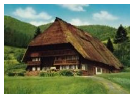
Foto aus Freilichtmuseum Vogtsbauernhof Gutach