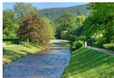
Von Martin Dürschmabel - Eigenes Werk, CC BY-SA 3.0, https://commons.wikimedia.org/wiki/index.php?board=5&IAC21